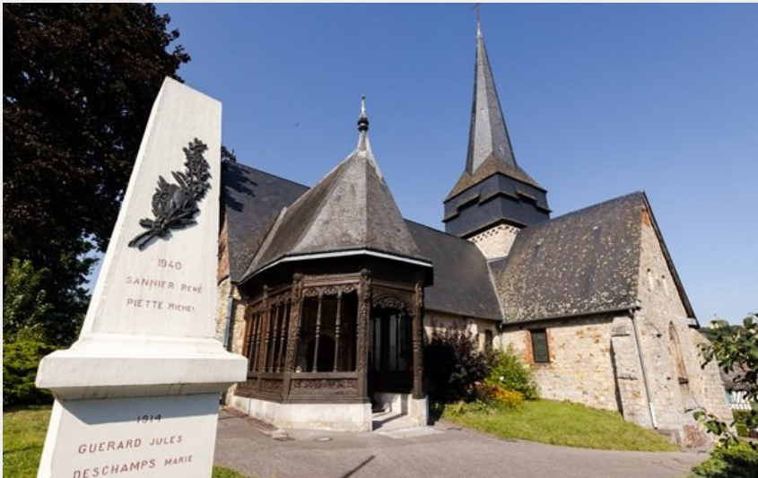
Attribution : église - Ry - 08.09.2021